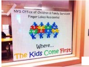
A sign at the Finger Lakes Residential Center, a juvenile detention facility near Ithaca, New York.

When New York kids get convicted of a crime, they are either sent upstate to the juvenile equivalent of a prison, or allowed to stay at home enrolled in mandatory programs that aim to turn them into law-abiding citizens. The vast majority of inmates come from New York City. On Tuesday, Mayor Michael Bloomberg announced he wants to overhaul the upstate juvenile facilities because they have been plagued with incidents of abuse, they are expensive (approximately $270,000 a year per inmate) and they are located hours away from the childrens' families.